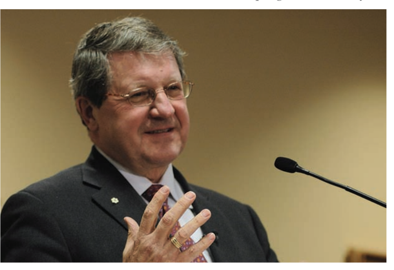
Former Canadian Minister of Foreign Affairs, Mr. Lloyd Axworthy's keynote speech addressed the issues of human security and the "Responsibility to Protect".

In the Third World, the U.S. invasion of Iraq and its ex post facto rationalization on human security grounds had created an atmosphere of distrust that was affecting attitudes towards reform generally and undermining the emerging norm of the Responsibility to Protect, in particular. Politically motivated attacks in Congress on the UN and on the Secretary General affected the atmosphere in New York and in capitals around the world. Some observed that the Congress held the secretariat to higher standards of probity and effectiveness on the Oil for Food program than they